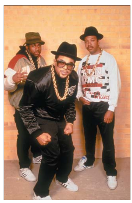
Run DMC, Hip-Hop-Band

Mv Adidas, Mv Adidas Now the Adidas I possess for one man is rare Myself homeboy got fifty pair Got blue and black 'cause I likes to chill And yellow and green when it's time to get ill Got a pair that I wear when I'm playin' ball With the heel inside make me 10 feet tall My Adidas only bring good news And they are not used as selling shoes They're black and white, white with black stripe The ones I like to wear when I rock the mic On the strength of our famous university We took the beat from the street and put it on TV My Adidas are seen on the movie screen Hollywood knows we're good, if you know what I mean We started in the alley, now we chill in Cali And I won't trade my Adidas for no beat up Ballys My Adidas