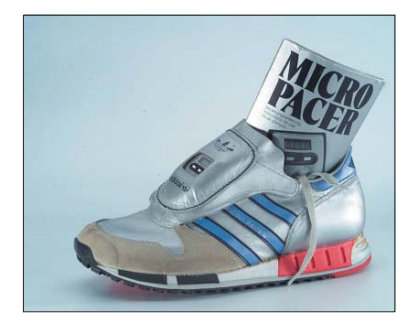
jogging shoe, 1984

More important, however, is the right choice of footwear. Heel cushioning, gas cushioning, gel cushioning, shock absorbers or mid-sole stabilizers help absorb the shock of each step the jogger takes, which can even be several times the body weight of the jogger. As the jogger runs to lose those excess pounds, the sports shoes put on more and more weight.