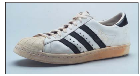
adidas superstar, 1969

If we believe the saying "You are what you wear" to be true, then how can it not apply to the shoe? The cult surrounding the sneaker, the chic sibling of the good old gym shoe, was most apparent in the 1990s. Interest in collector items, something which was for a long time reserved for serious collectors only, became something of a cultural phenomenon. Sneakers came out every three months in new designs and colour combinations, classic lines revamped in retro-style and limited-edition haute couture lines. The hungry collectors market is well fed with regular courses of cleverly marketed new shoe lines. In the world of the Internet fanatical sneaker fans chat on what are known as sneaker sites containing vast archives of