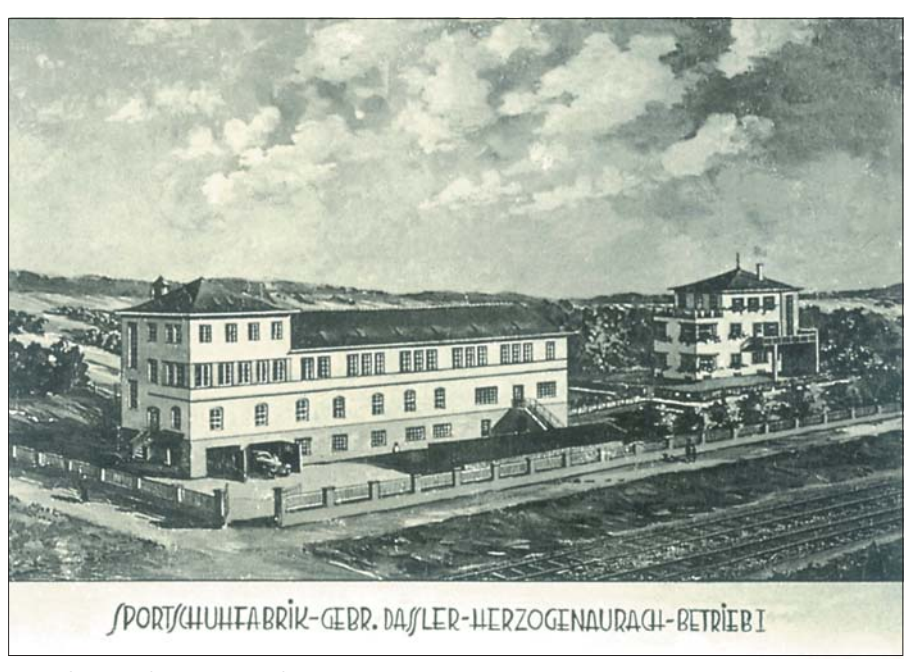
Dassler Brother Sports Shoe Factory, 1938

boots for professional sportsmen, developed in close co-operation with trainers and the sportsmen themselves. The first shoes to be patented by the Dasslers were track shoes with six spikes which entered the international sports scene at the 1928 Olympic Games in Amsterdam. In the 1930s, the product range included specialist shoes for eleven different types of sports, ranging from shoes for the highjump, long-jump and hammer throwing to ice-hockey boots, ski boots and tennis shoes. The international breakthrough came when outstanding athlete Jesse Owens from the USA wowed audiences with his 4-Gold medal performance at the 1936 Olympic Games in Berlin wearing shoes by Dassler.