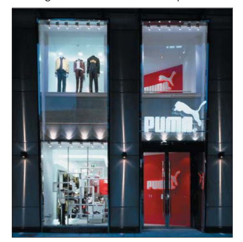
Puma-Conceptstore in Frankfurt

Much to the surprise of established fashion companies, the Puma label and the Three Stripes found their way into extravagant fashion boutiques, challenging established fashion labels. In recent years, the corporations from Herzogenaurach have developed fashion lines inspired by sports and represented by icons from the music and